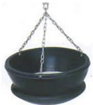
530mm diameter x 240mm deep